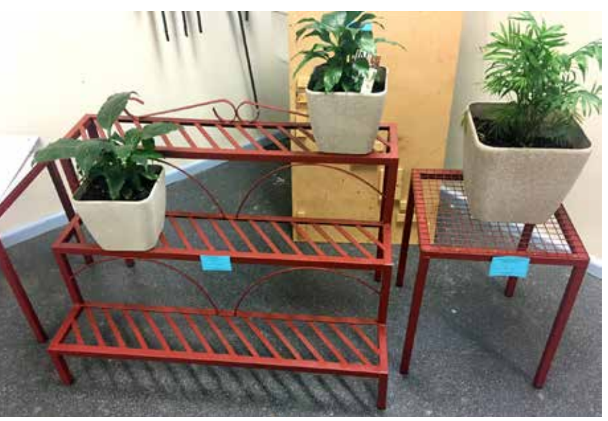
James presented a series of plant stands.