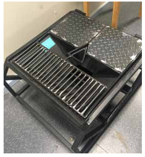
Bryce constructed a firepit.