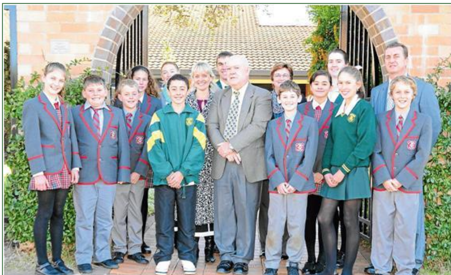
YEAR 6 TRANSITION GUNNEDAH SOUTH PUBLIC SCHOOL

Excellence and Innovation in a Unique and Caring School