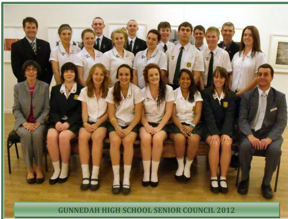
GUNNEDAH HIGH SCHOOL SENIOR COUNCIL 2012

The Principal and Staff wish you a Happy Easter