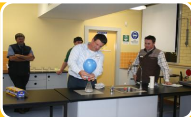
School Based Traineeships